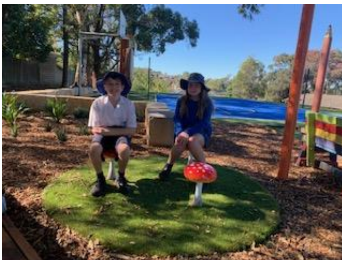
Shaded play platform