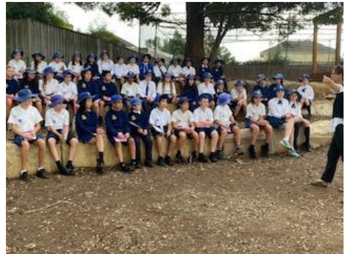
Shaded log seating