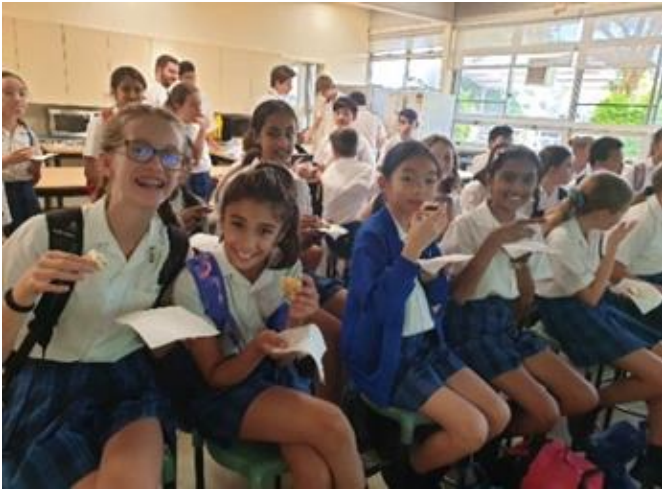
Year 6 learnt how to say the colours in Japanese.