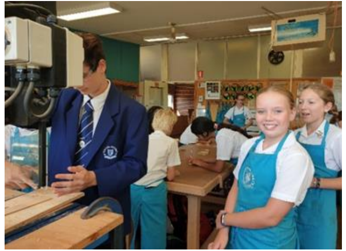
The students also enjoyed developing photos in photography.