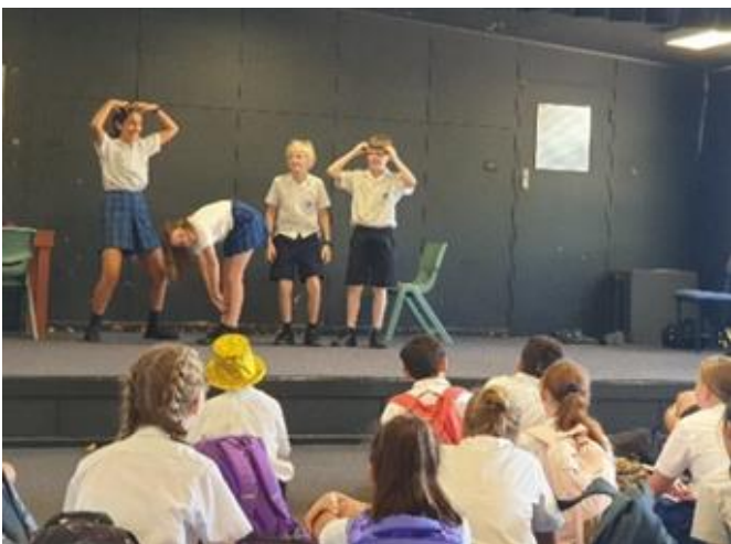
During Industrial Arts the students made bookmarks out of wood and leather.